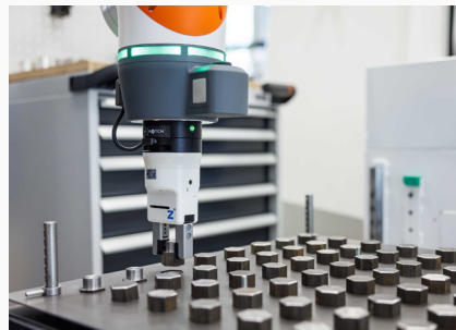
Pick-and-place/Handling: maximum fast & productive