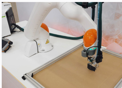
Gluing: Cost effective & functional

Applications in action: Learn more in our YouTube playlist now!