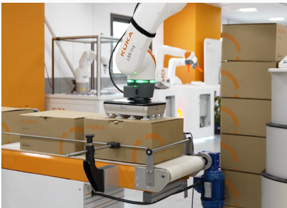
Palletizing: efficient & flexible

»» These diverse possibilities are offered by the LBR iisy and the operating system iiQKA.OS.