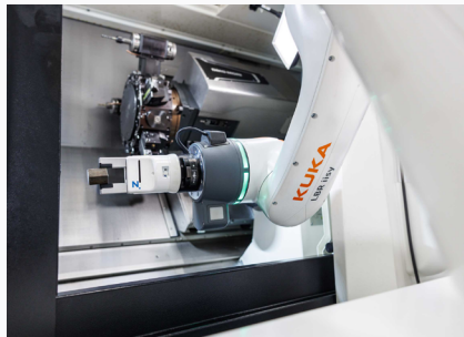
Machine loading/ unloading: reliable & intuitive