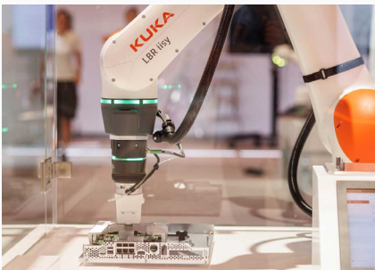
Assembly, e.g. of printed circuit boards: relieving & cost saving