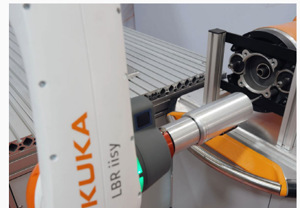
Thread testing: true to the millimeter & reliable