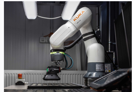
Quality inspection: fast & precise